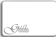
Gift Card 1