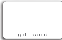
Gift Card 2